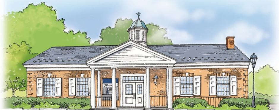
Sumneytown Branch 3090 Main Street, Sumneytown

Bank Local. Be Proud. Get Rewarded. That's Harleysville.