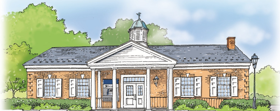
Sumneytown Branch 3090 Main Street, Sumneytown

Bank Local. Be Proud. Get Rewarded. That's Harleysville.